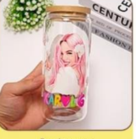
Ready tu use