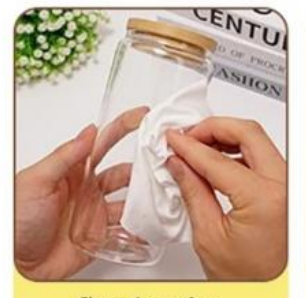
Clean the surface

Be careful not to stick it on the radians atboth ends It is easy to stick it not firmly