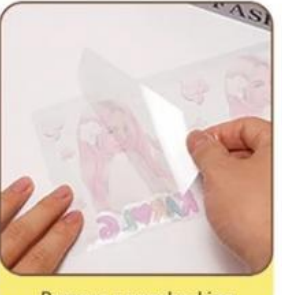
Remove paper backing