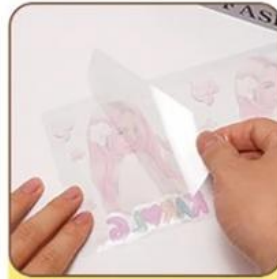
Remove paper backing