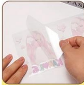
Remove paper backing