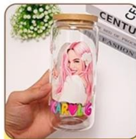
Ready to use