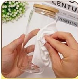
Clean the surface

Be careful not to stick it on the radiations at both ends It is easy to stick it not firmly