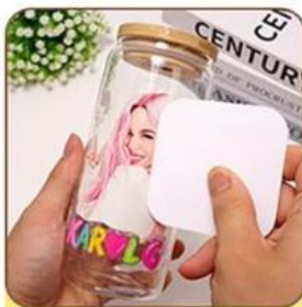
Apply heavy pressure