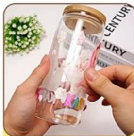
Peel clear film off the clear film